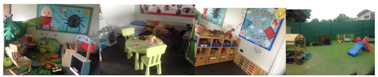
Bumble Bees (Our preschool room)